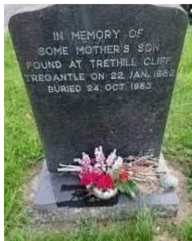
This headstone was purchased from money collected from the Torpoint Community