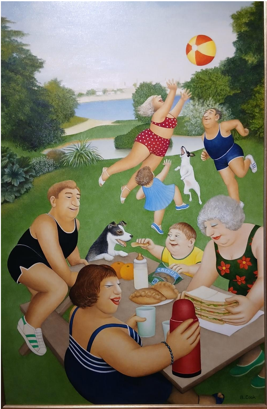
Mount Edgcumbe

On a very light note.....if you need cheering up, a visit to Beryl Cook's Exhibition showing in St Luke's Church, part of The Box, is a real Winter tonic!