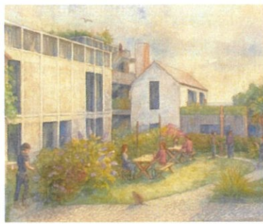
Brigantine Co-housing scheme, Penryn (14 homes)