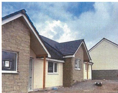
Land West of Dobwalls Primary School (17 Affordable Rent and 7 Shared Ownership)