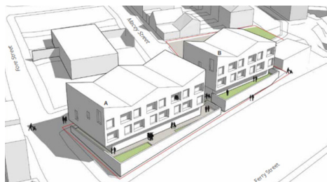
Location at the bottom end of Lower Fore Street