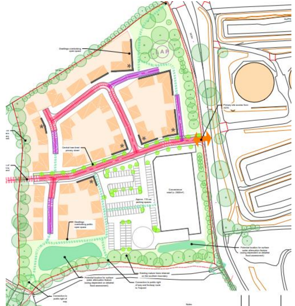
Snip of Indicative Site Plan for Defiance Field Site (lhc design)

Torpoint Town Council continues to work with Cornwall Council and Antony Estate to ensure any development comes forward as part of a coherent masterplan in conformity to our Draft Neighbourhood Plan with appropriate mitigations for the potential loss of sporting fields.