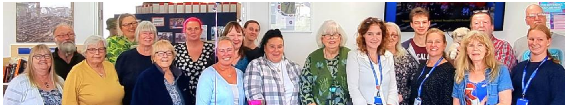
Access to Local Social Prescriber Tuesday