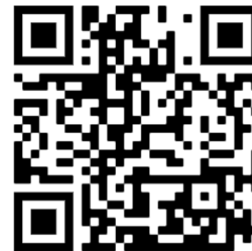
Torpoint Town Council Strategy

To ensure the provision of assets, services and to influence the supporting infrastructure to enable the community to grow and flourish, delivering the Vision for Torpoint, whilst protecting and enhancing the natural environment and town heritage.