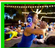
SILENT DISCO YOGA THU 15 AND FRI 30 AUG