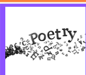
NONSENSE POETRY TUE 13 AUG