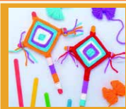
MAYAN GOD'S EYE'S TUE 20 & THU 22 AUG