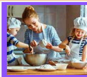
EASY BAKING TUE 27 & WED 28 AUG