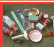
INSTRUMENT MAKING WED 14 AUG