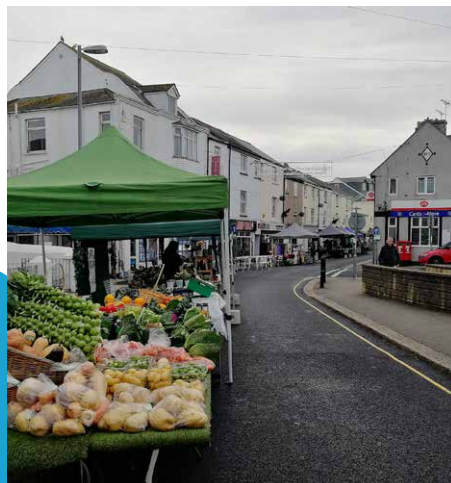
2023 Torpoint Street Market