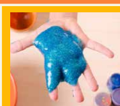
SLIME MAKING TUES 6, WED 7 AND MON 26 AUG