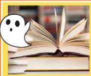
SPOOKY STORY FRI 16 AUG