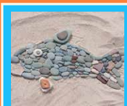
BEACH ART FRI 9 AUG