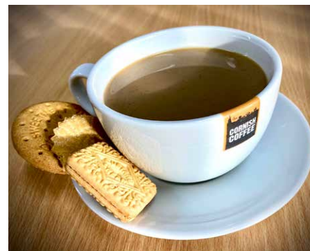
Fri 27 Sep - MacMillan Coffee Morning