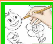
COMIC BOOK MAKING THU 25 JUL