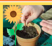
SUNFLOWER PLANTING THU 1 AUG