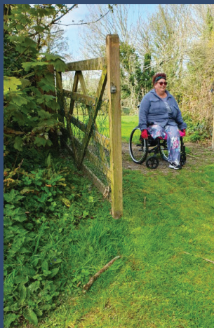
Pictured: Torpoint Diverse Advisory Panel Member accessing Thanckes Park Play Park.

The Panel has now met several times, and after completing an Accessibility Audit with a member from disAbility Cornwall & Isles of Scilly, around Torpoint, an Accessibility Statement has been produced, which is being regularly updated. The panel decided that their April meeting would include an accessibility tour around Thanckes Park play park, endeavouring to make access from the car park to the play park more appropriate for less able-bodied individuals. After spending time on site it was clear there is potential for this happen - keep your eyes peeled for further updates.