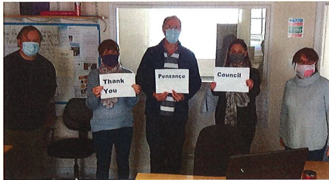
Staff and volunteers at CA's Penzance office celebrate the recent generous financial donation from Penzance Council towards their work in the town.