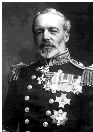
Rear-Admiral Christopher Cradock

T he first British naval defeat for more than a century, engaging the enemy without hope of victory. Rear-Admiral Sir Christopher Cradock, his flagship HMS Good Hope , and HMS Monmouth were sunk with all hands by the powerful cruisers of Vice-Admiral Graf von Spee