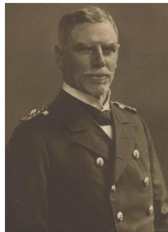
Vice-Admiral Maximilian von Spee